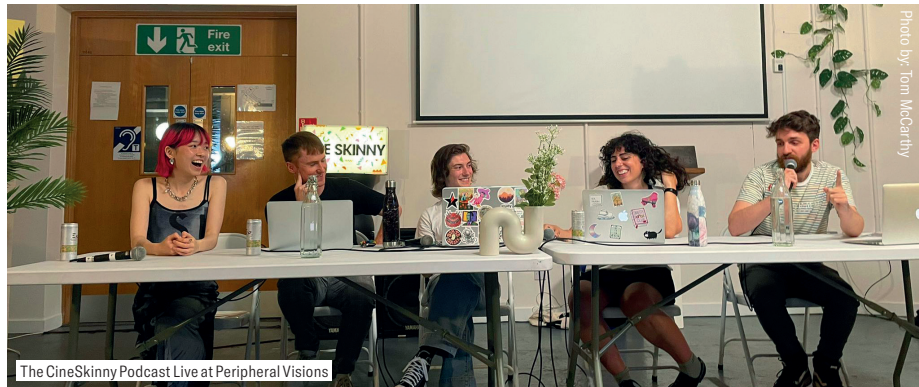
The CineSkinny Podcast Live at Peripheral Visions

Get in touch to find out how to support The Cineskinny and align your brand with our cutting-edge film content: sales@theskinny.co.uk