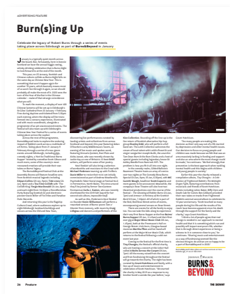
Advertorial in print

For campaigns requiring a more tailored approach.